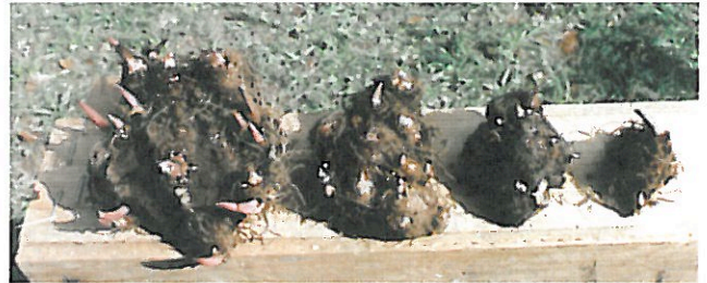
Mammoth Jumbo #1 #2

If you core bulbs, use an old fashion potato corer (de-eyer) - remove no more than 1/4" of the tuber with the eyes. Core only the 1-4 primary eyes; number of eyes needing removal depends on bulb size and variety. Allow the open area to seal over (callus) before potting, or it might get infected and rot after potting. 48 hrs. in open area (hot as possible) is enough time to allow the callousing of the eye removed area.