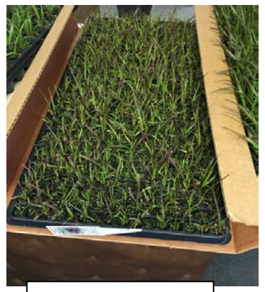
Pennisetum Rubrum 512 Cell