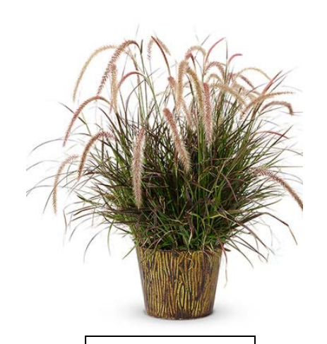
Red Riding Hood