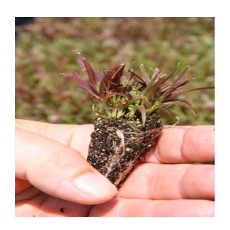
Pennisetum Rubrum 200 Cell

PENNISETUM FIREWORKS – SKYROCKET – CHERRY SPARKLER – RED RIDING HOOD MISCANTHUS GOLD BREEZE - CAREX ICE CREAM