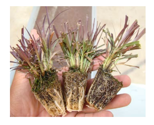
Pennisetum Rubrum 72 Cell