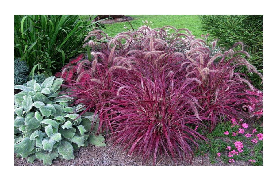
MESSICK COMPANY LLC 142 NORTH CENTRAL AVE. CAMPBELL, CA 95008