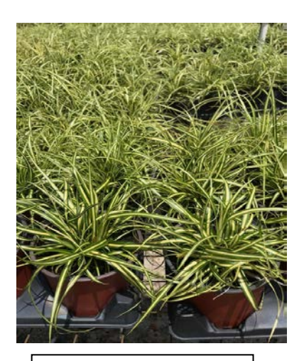
Carex 'Ice Cream'