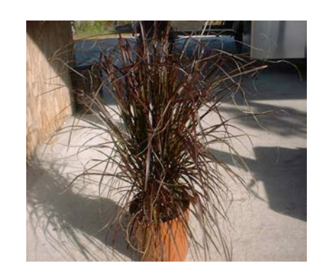
288 cell planted in 3 gallon in Central Florida ~ Planted 10/6/06 Pictured 12/8/06 (9 Weeks)