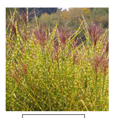
Miscanthus 'Gold Breeze'